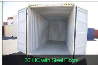
20' HC with Steel Floors

For heavy duty use, steel floors allow for an extra load bearing weight and longer container life. Timber floors are the cheaper alternative and have been chemically treated to deter insects.