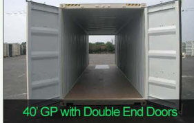
40' GP with Double End Doors

Standard containers are commonly available as 20 foot (6m) or 40 foot (12m). Generally, 2 x 20 foot containers would take preference over 1 x 40' unless the items to be stored inside required the more than 3 meters in length.