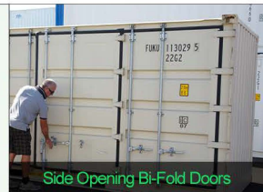
Side Opening Bi-Fold Doors

Depending on your access requirements, new standard containers are available with bi-fold opening doors one or each side and cargo doors on one or both ends.