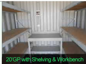
20'GP with Shelving & Workbench

Shipping containers can be equipped with heavy duty tiered shelving, equipment racks, gear trays and workbenches to create a portable storage space, equipment store or workshop.