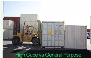
High Cube vs General Purpose

Standard containers are available in general purpose, high cube and pallet wide formats. The high cube allows for an extra 30 centimeters in height and a pallet wide can fit two pallets side by side.