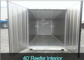
40' Reefer Interior

Refrigerated containers are commonly available as 20 foot (3m) or 40 foot (6m) in general or high cube formats. Longer 48 foot containers are also available from time to time.