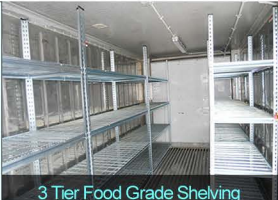
3 Tier Food Grade Shelving

Containers can be fitted with fully adjustable food grade shelving on request.