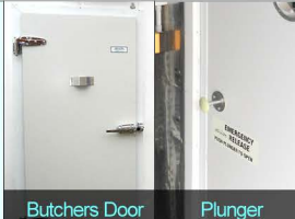
Butchers Door Plunger

Refrigerated containers can be fitted with side opening butcher's style doors with safety release plungers to assist with frequent staff access requirements.