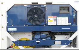
20' Reefer Motor

Conditions inside refrigerated containers can be exactly controlled from -25 to +25 degrees C and partitioned to include chiller and freezer sections. Temperature can be monitored via internal and external gauges.