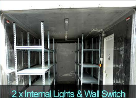
2 x Internal Lights & Wall Switch

Refrigerated Containers can be fitted with lighting, power outlets and alarms internally or externally.